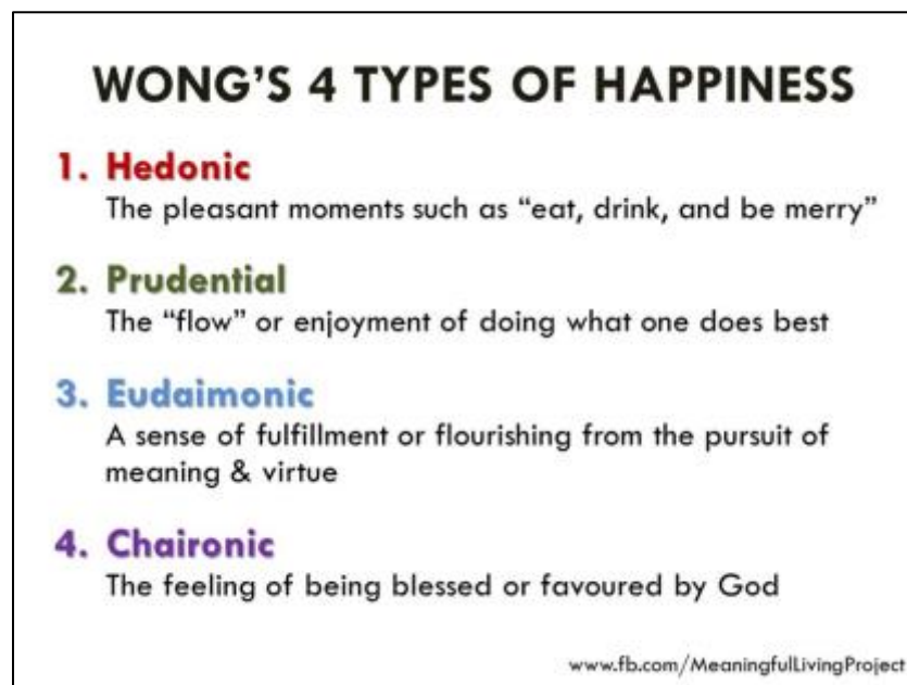
Figure 4. Four different types of happiness (Wong, 2011).

There are at least four types of happiness according to Wong (2011), as shown in Figure 4. We all need happiness in our marriage, but marital satisfaction depends on what type of happiness we pursue. Hedonic happiness is part of a happy marriage. Even older couples can still frequently enjoy a good “date” of dining out or going to a theatre or concert. However, when one’s life is completely devoted to hedonic pursuit, it will likely lead to boredom and risky exciting activities to combat that boredom.